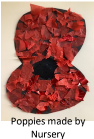
Poppies made by Nursery